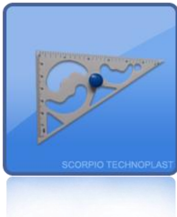
Product Name: Set Angle