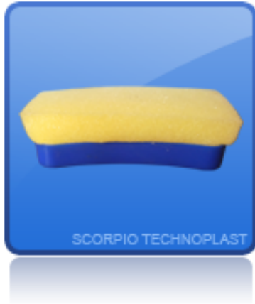
Product Name: Duster