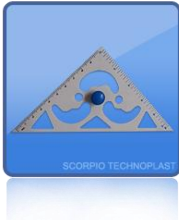
Product Name: Set Square