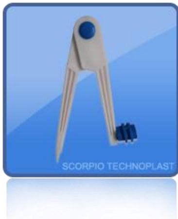
Product Name: Compass