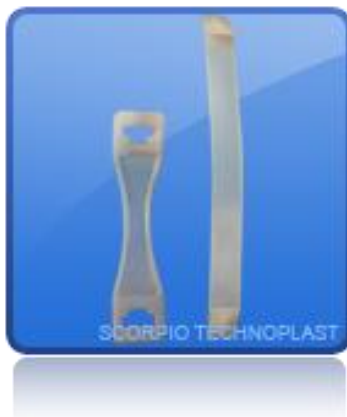
Product Code: BH 102