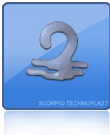
Product Code: SH 105

Usage: This product is used for socks & other products packaging