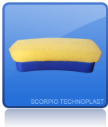
Product Code: DS 202