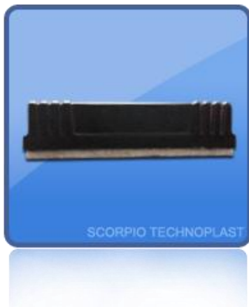
Product Code: DS 201

White Board Duster with felt gives easily handling to clean the board. it contains plastic heavy body and non woven felt on top to clean the surface completely without any hassle.