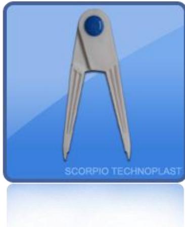
Product Name: Divider