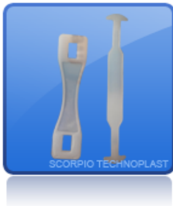
Product Code: BH 101

Plastic Handles or box handles are usually used in Courogated Boxes for electrical goods like DVD, Home Theatre, Gift Boxes etc. These handles are made by high grade of plastic raw material that ensures durability. Handles have efficiency to carry the weight upto 20kg.