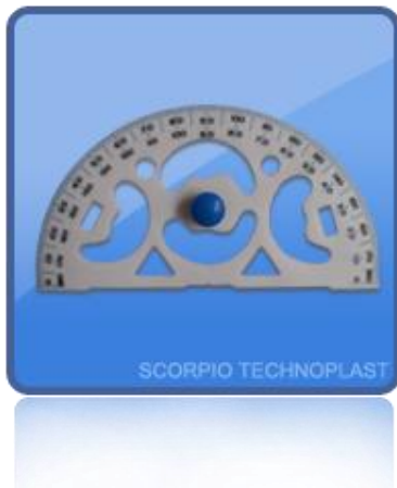
Product Name: Protector