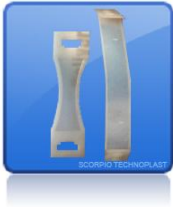
Product Code: BH 103